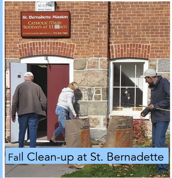
Fall Clean-up at St. Bernadette