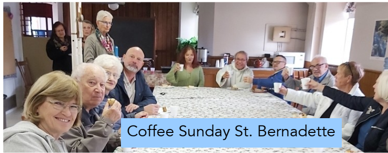
Coffee Sunday St. Bernadette