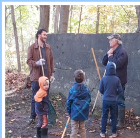
Fall Clean-up St. Thomas More