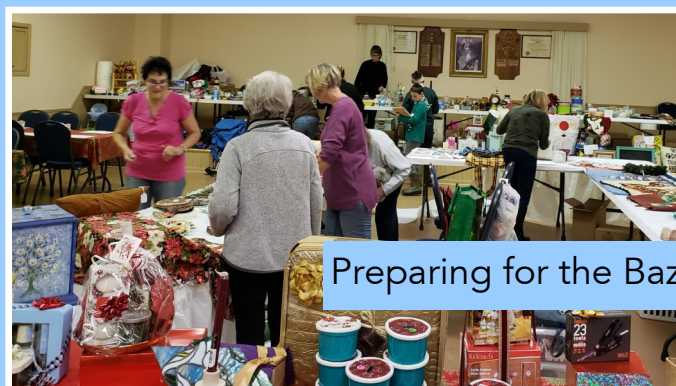
Preparing for the Bazaar