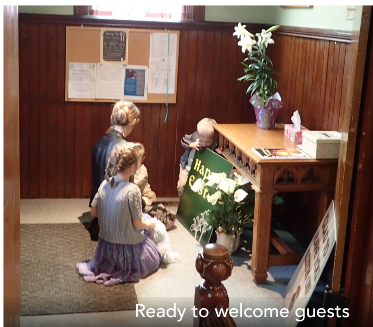
Ready to welcome guests

Easter has offered a great many things to celebrate including a full church, the forgiveness of sins, the end of death and a promise to those who follow Our Lord. The candles lit at the Easter Vigil not only illuminated our church and dispelled the dark of night but revealed the light of our faith rooted in the resurrection.