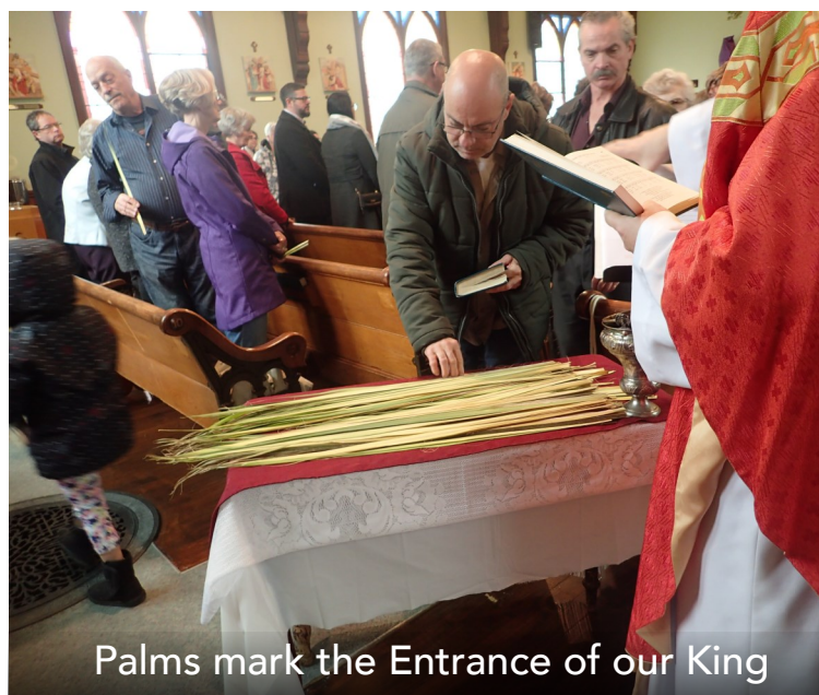
Palms mark the Entrance of our King