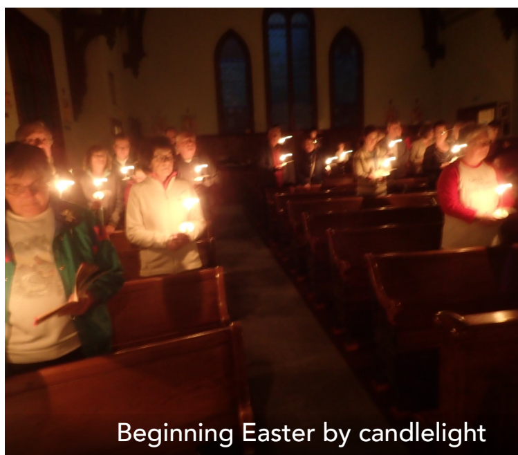
Beginning Easter by candlelight