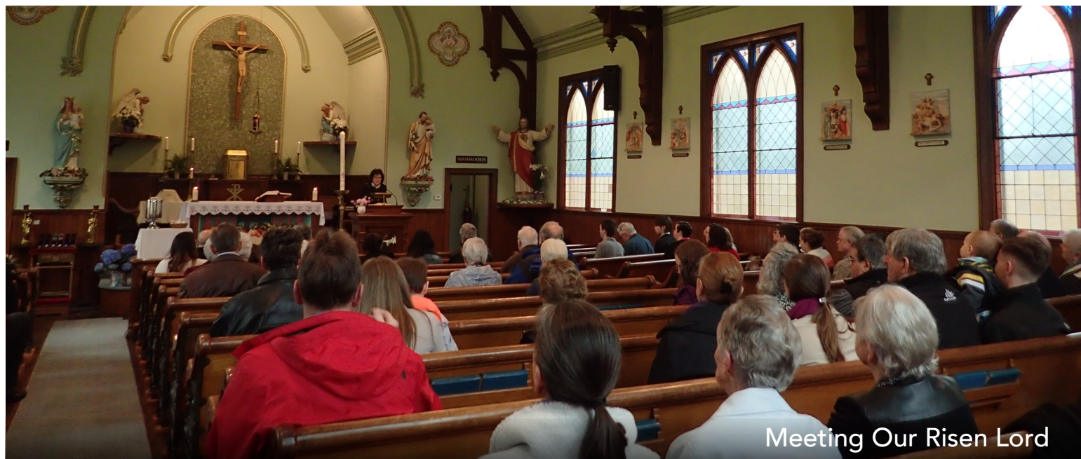
Meeting Our Risen Lord