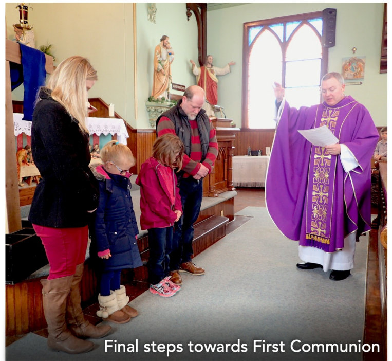
Final steps towards First Communion

It's been a month of preparations. A day of mercy, featuring many opportunities for prayer, offered a time for all to prepare for Easter by experiencing the mercy of the Father. Some of our youngest members began preparations for First Communion by receiving a blessing as others took the final steps of preparation to be welcomed into the Church at Easter through the Symbolon sessions. In preparation for some new steps that, hopefully, eliminate some safety and drainage issues, the old ones were removed.