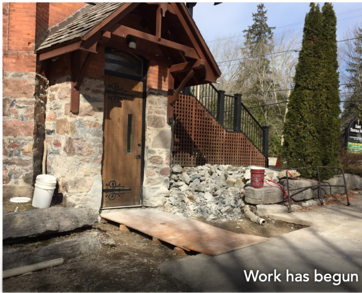
Work has begun