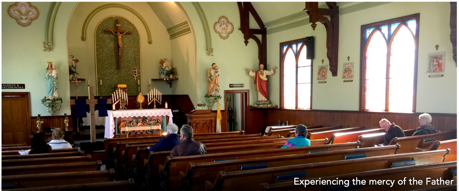
Experiencing the mercy of the Father