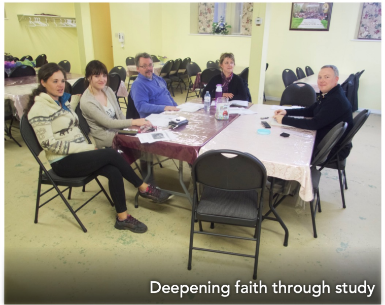
Deepening faith through study