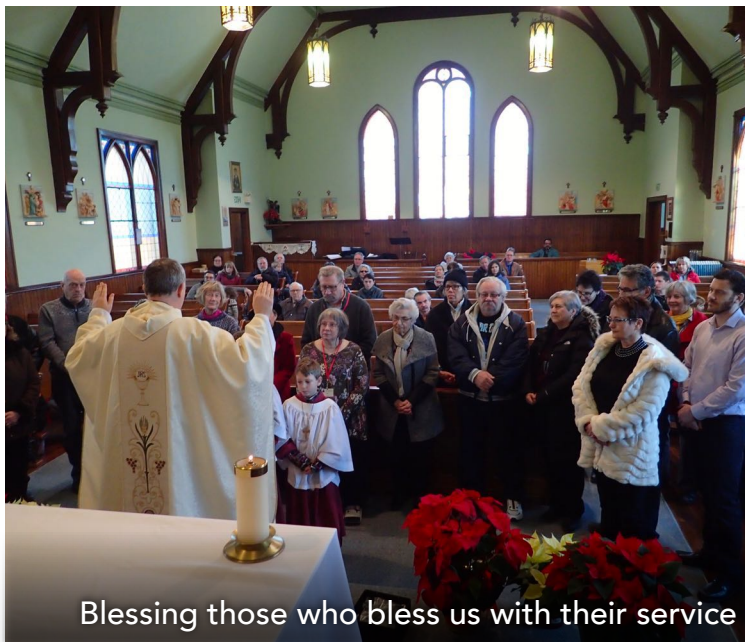
Blessing those who bless us with their service