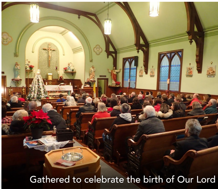
Gathered to celebrate the birth of Our Lord