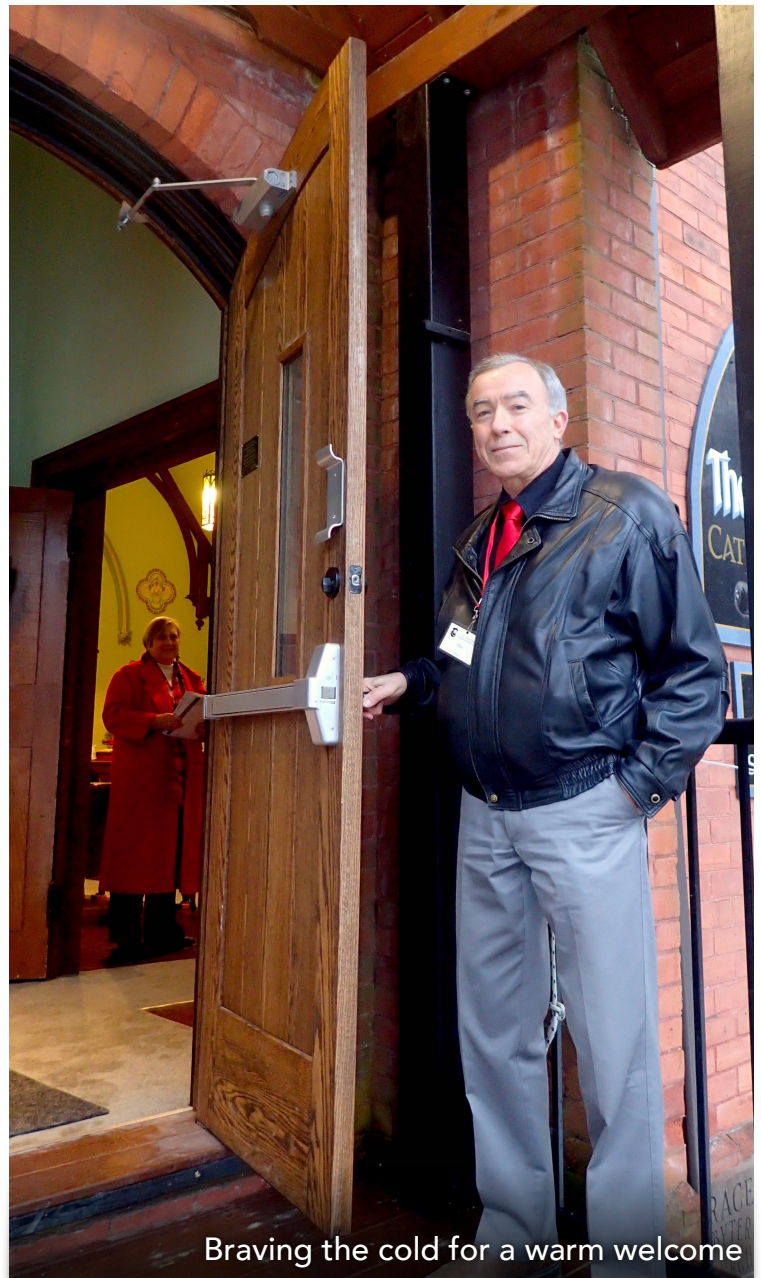
Braving the cold for a warm welcome